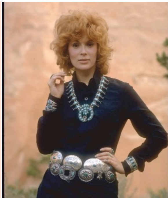
Jill St. John

Next after anger in the demonic pantheon is fear. Fear is deadly. Fear is the ultimate stupidity.