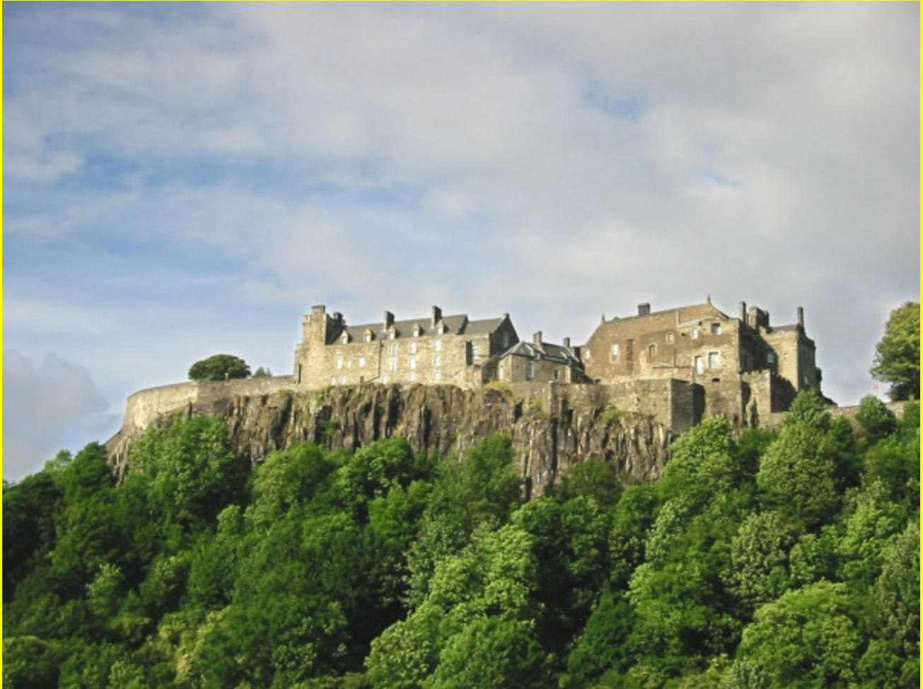
Stirling Castle, Historically Important, Located In Stirling, Scotland