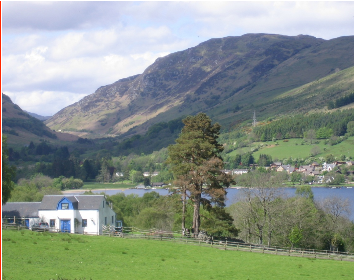
Lochearnhead at Glen Ogle, Loch Earn