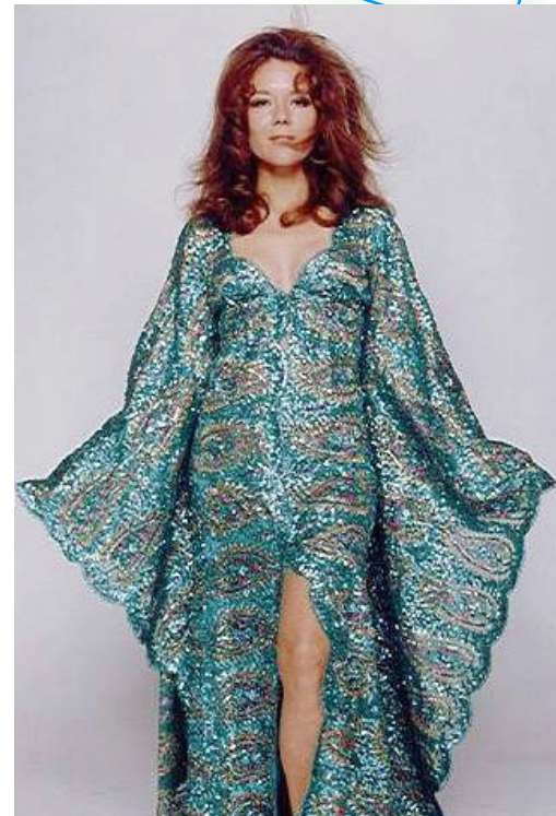
Diana Rigg, First Lady of the British Proscenium