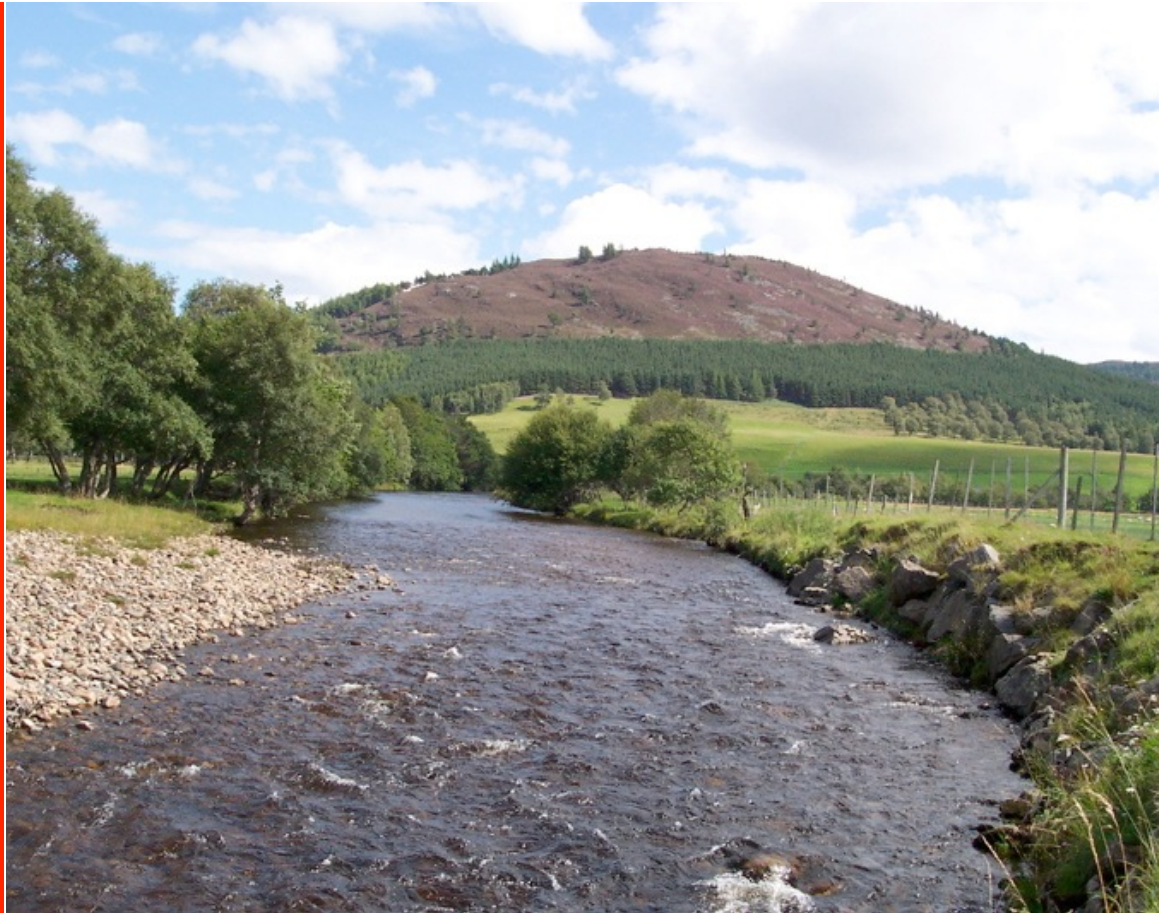
The River Dee Near Braemar, Aberdeenshire, Scotland.