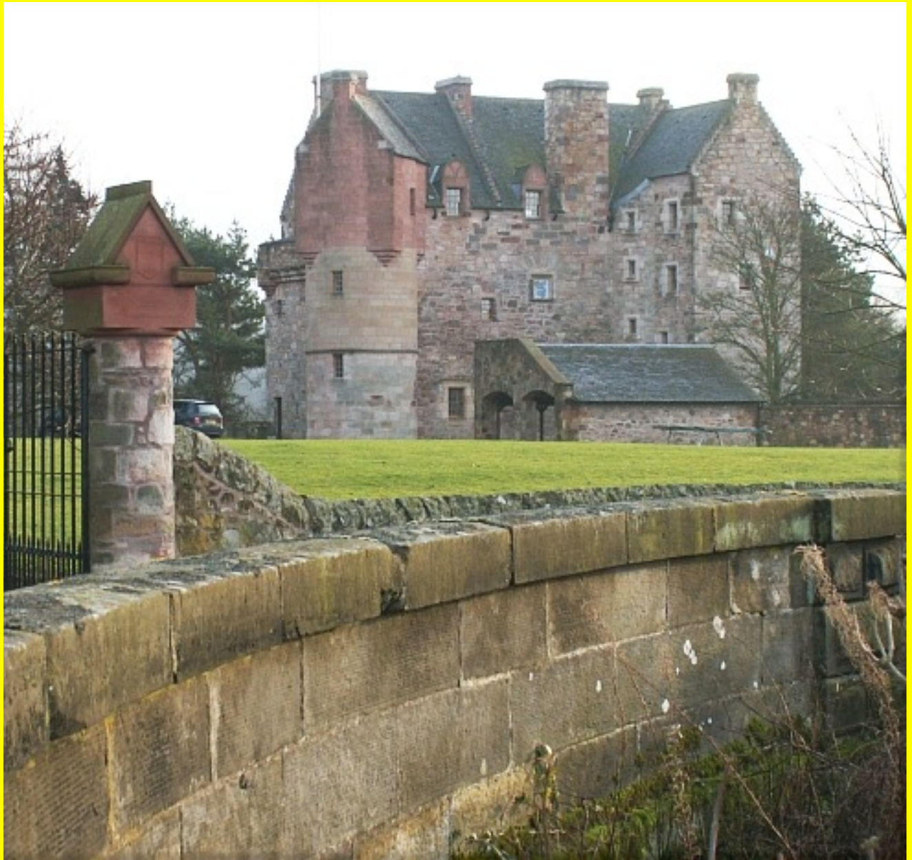
Dairsie Castle, Overlooking River Eden, In Fife, Scotland