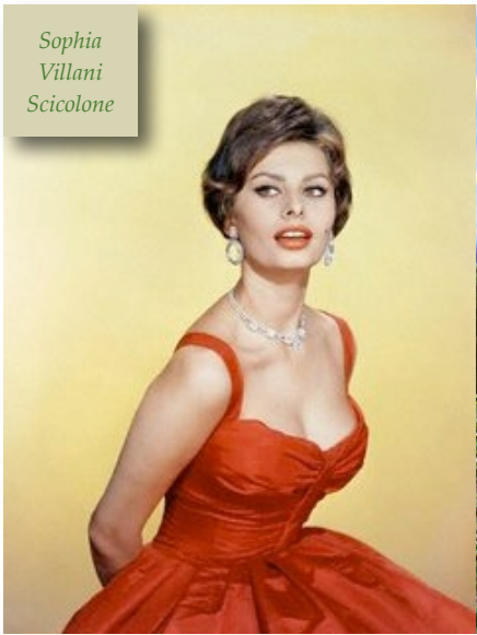
Sophia Villani Scicolone