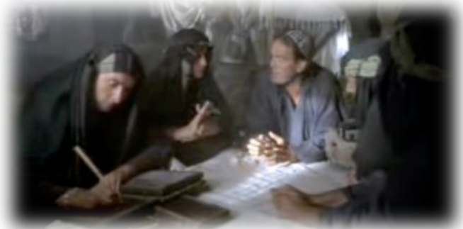
Meeting To Take Action Click Here

Criminalization of ever wide and wider circles of activity is a salient feature of the modern world, remarked forebodingly by not a few. Once one thing is "unacceptably" offensive, there is no intrinsic standard for not making anything "unacceptably" offensive.