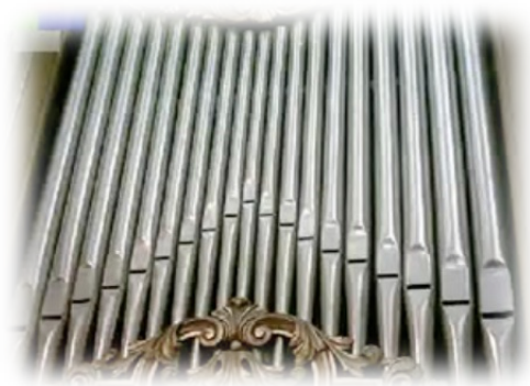
"The Dorian" Toccata Click Here

Criminalization of ever wide and wider circles of activity is a salient feature of the modern world, remarked forebodingly by not a few. Once one thing is "unacceptably" offensive, there is no intrinsic standard for not making anything "unacceptably" offensive.