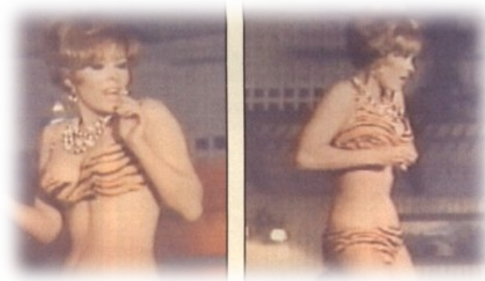
Jill St. John