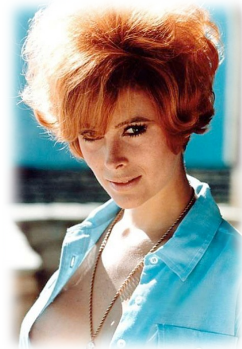
Jill St. John