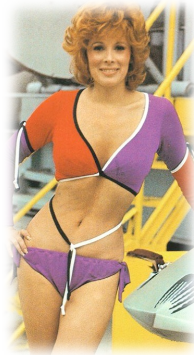
Jill St. John