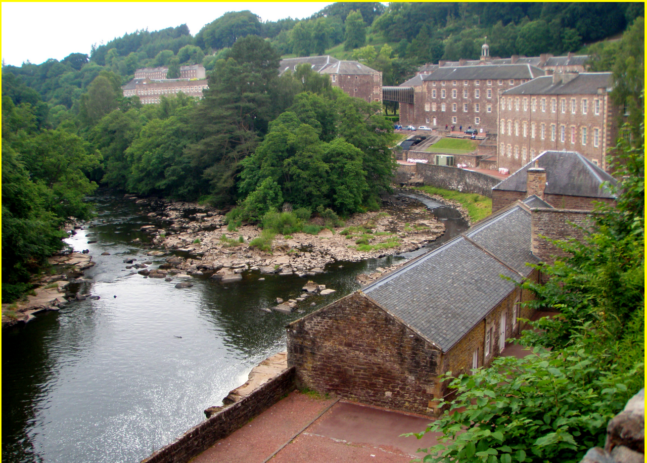
New Lanark, South Lanarkshire, Scotland