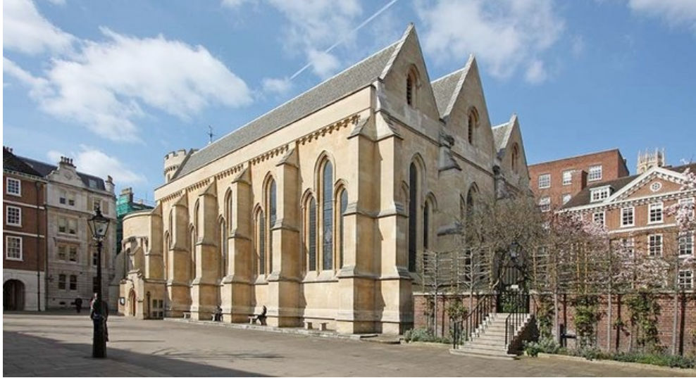
The Temple Church, London, Great Britain